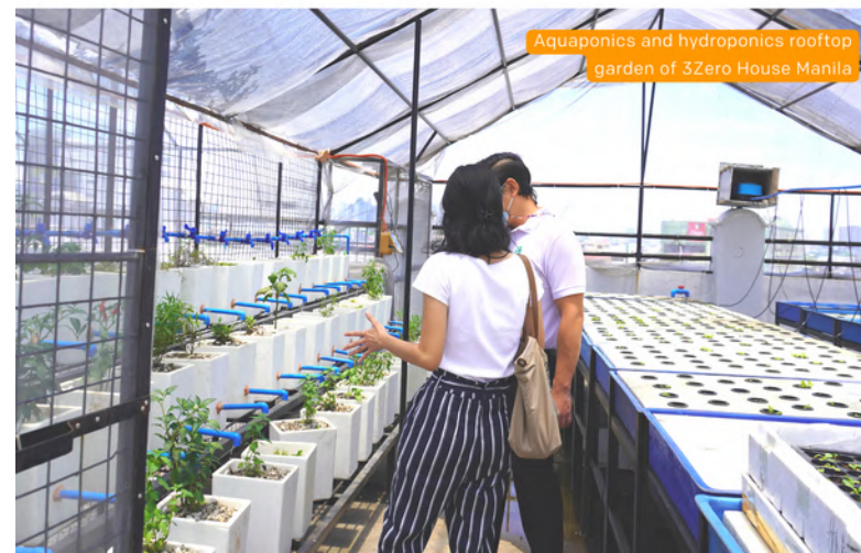
Aquaponics and hydroponics rooftop garden of 3Zero House Manila