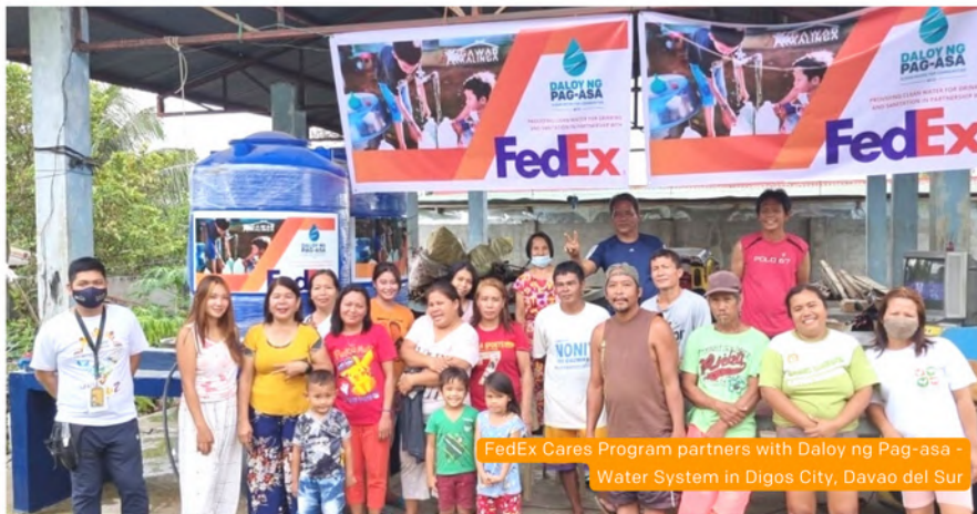
FedEx Cares Program partners with Daloy ng Pag-asa - Water System in Digos City, Davao del Sur