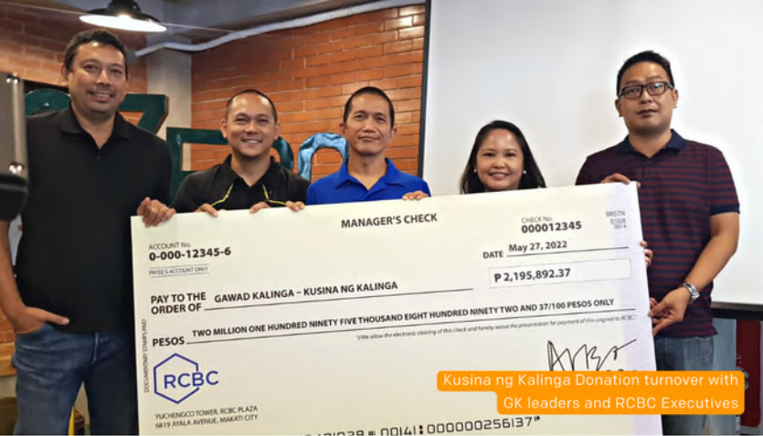
Kusina ng Kalinga Donation turnover with GK leaders and RCBC Executives