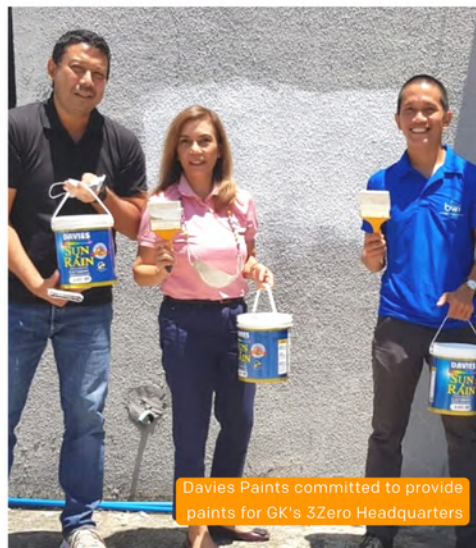
Davies Paints committed to provide paints for GK's 3Zero Headquarters