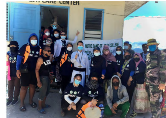
Notre Dame of Jolo College for Maleta Library project in Sulu

Private volunteer groups are a big source of funds for community projects. They are the starting platform for collaboration between private individuals with the same intent to help a community. Such an example is PICE-UAE (Philippine Institute of Civil Engineers- UAE Chapter) where a group of engineers based in Dubai came together to raise funds for a water well system in Bato, Camarines Sur. They discovered this project through the feature of a youth group, the Batoeno Youth Advocates, on the Bayani Challenge FB page after which they moved on to build a daycare center for an indigenous community in Bukidnon. Inspired by the youth who were rallying for the poor communities in their areas, PICE-UAE responded with the funds, which allowed GK and the communities to implement the project. This 3-way partnership saw these 2 projects to completion in less than 3 months' time.