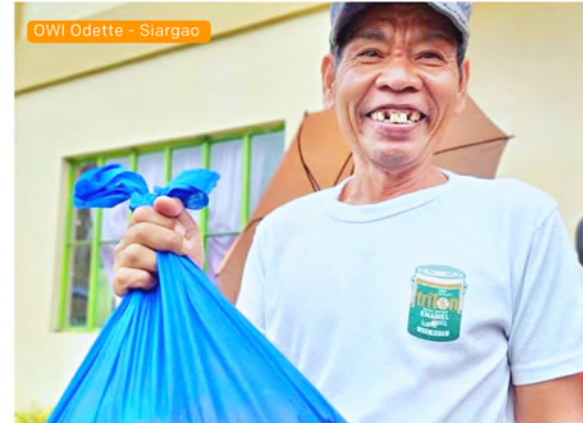
OVI Odette - Siargao