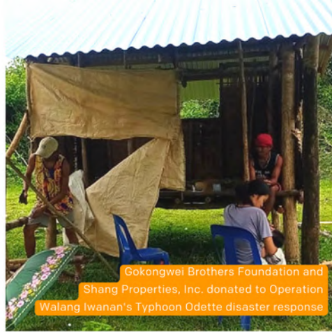
Gokongwei Brothers Foundation and Shang Properties, Inc. donated to Operation Walang Iwanan's Typhoon Odette disaster response