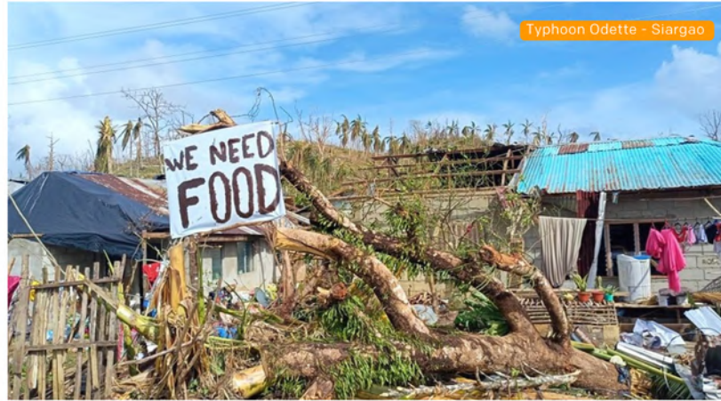
Typhoon Odette - Siargao

Typhoon Odette was a super typhoon that hit the Visayas region, Palawan and certain parts of Northern Mindanao last December 2021. From an initial category 1 typhoon rating, it immediately moved up to category 5 within hours after landfall, catching most of the affected residents off guard. With sustained winds of 195kph, pushing up to 270kph gusts, this strongest typhoon of 2021 has caused damages to infrastructure and agriculture amounting to billions of pesos. It has been reported that over half a million families were affected with two million-plus houses damaged (needing repair and/or completely destroyed).