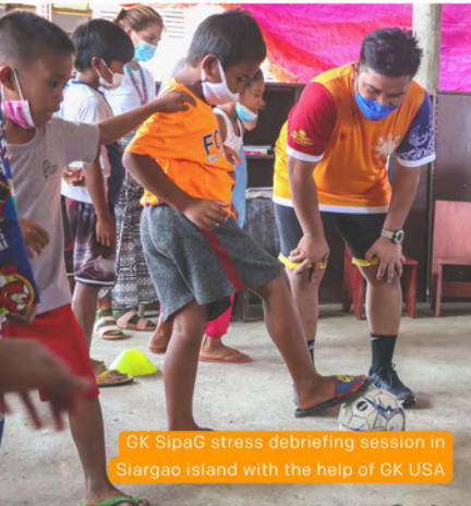
GK Sipag stress debriefing session in Siargao island with the help of GK USA