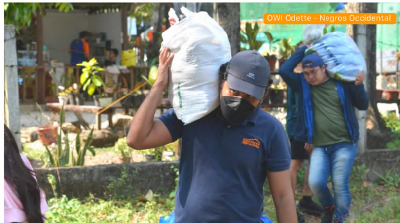
OVI Odette - Negros Occidental

Typhoon Odette was a super typhoon that hit the Visayas region, Palawan and certain parts of Northern Mindanao last December 2021. From an initial category 1 typhoon rating, it immediately moved up to category 5 within hours after landfall, catching most of the affected residents off guard. With sustained winds of 195kph, pushing up to 270kph gusts, this strongest typhoon of 2021 has caused damages to infrastructure and agriculture amounting to billions of pesos. It has been reported that over half a million families were affected with two million-plus houses damaged (needing repair and/or completely destroyed).