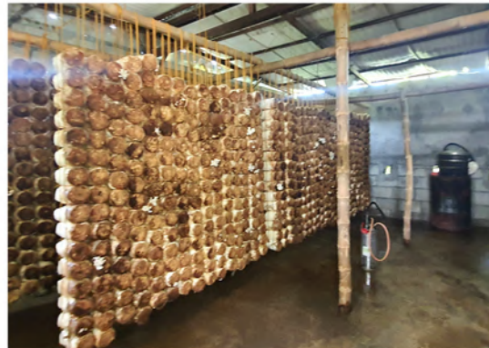
University of Neuva Caceres' mushroom business for a community in San Fernando, Camarines Sur