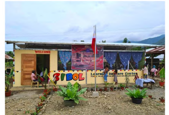
SIBOL Learning Daycare Center in Bukidnon through the efforts of PICE-UAE