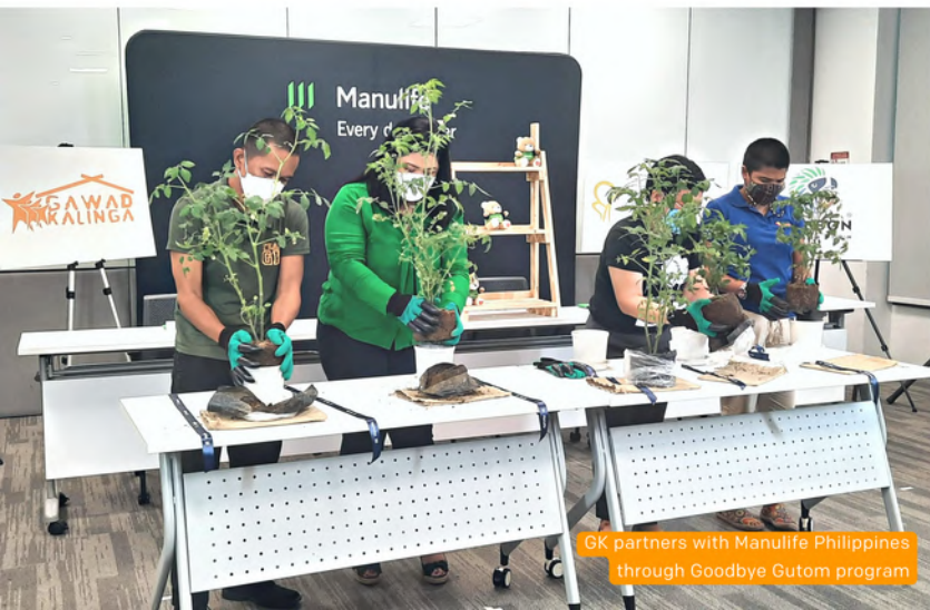
GK partners with Manulife Philippines through Goodbye Gutom program