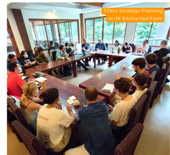
3Zero Strategy Planning in GK Enchanted Farm